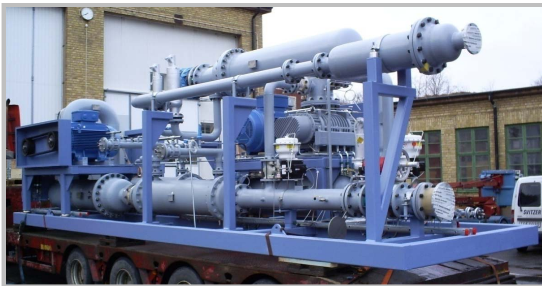
Two stage rotary lobe blower package for oxygen VPSA application